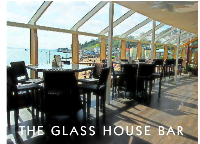
THE GLASS HOUSE BAR

The View function room along with the Glass House Bar opens onto our large Sea Garden Terrace. It's the perfect venue for a relaxed gathering with family and friends.