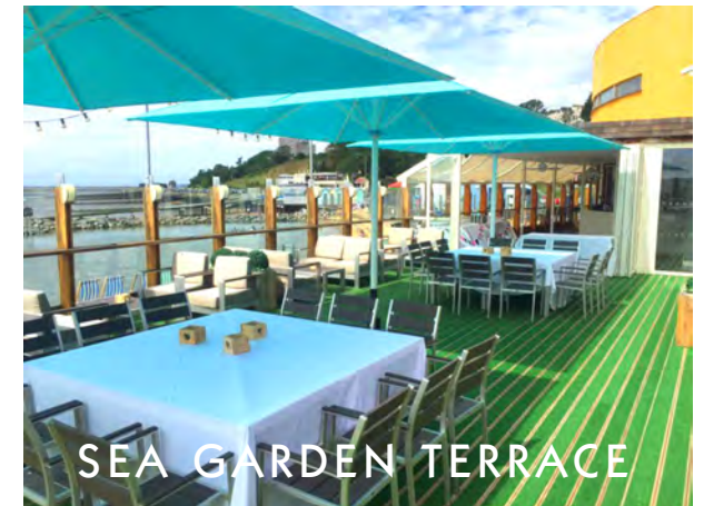
SEA GARDEN TERRACE