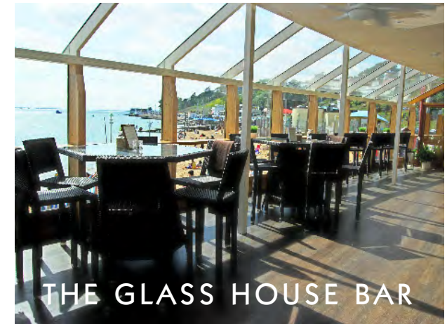
THE GLASS HOUSE BAR

The View function room along with the Glass House Bar opens onto our large Sea Garden Terrace. It's the perfect venue for a relaxed gathering with family and friends.