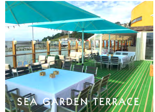
SEA GARDEN TERRACE